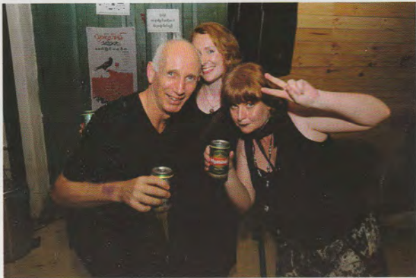
Yangon's First Darkwave and Gothic Night @ Pansodan Scene 11 July 2015