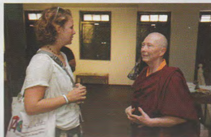
Yangon Echoes Chat Day 12th Jul 2015