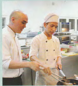
Shwe Sa Bwe