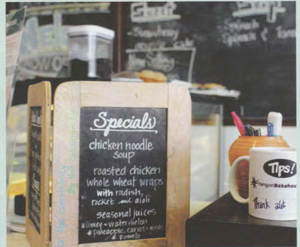
Yangon Bake House