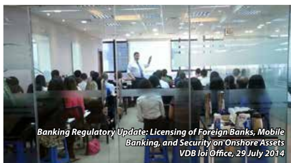
Banking Regulatory Update: Licensing of Foreign Banks, Mobile Banking, and Security on Onshore Assets VDB loi Office, 29 July 2014