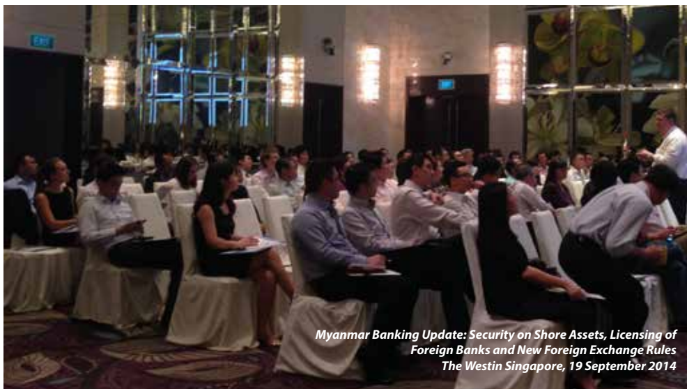
Myanmar Banking Update: Security on Shore Assets, Licensing of Foreign Banks and New Foreign Exchange Rules The Westin Singapore, 19 September 2014

While the 9 selected foreign banks are not yet ready to operate in Myanmar, particularly foreign-owned corporate borrowers prefer to have the disposal over bank accounts overseas. These “offshore bank accounts” can be used by Myanmar registered companies for a wide range of purposes, including paying foreign vendors and for facilitating financing transactions. The Foreign Exchange Management Act (FEMA) of 2012 explicitly allows Myanmar registered companies to open and use a bank account overseas for a number of purposes. S. 14 FEMA provides that: