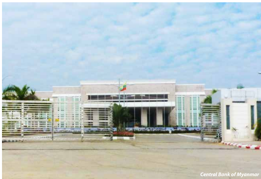
Central Bank of Myanmar

The CBM Letter envisages a new reporting and approval system, where Myanmar banks will need to collect certain data, make an assessment about certain criteria, report information to the CBM, and receive an approval. It seems to us that the Myanmar bank would have to go through this new process for each loan, even loans that were already approved by the MIC. For a Myanmar bank not to go through the process and receive CBM approval, which is theoretically possible as there is no physical restraint on release of funds by a Myanmar bank, might engage its liability.