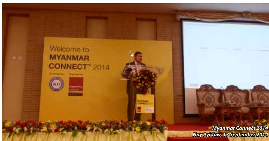
Myanmar Connect 2014 Nay Pyi Taw, 17 September 2014

The Draft Law does not reveal much on the regulatory framework of finance companies, or other NBFIs for that matter. It is clear that any existing finance companies must re-apply for a license under the new law within 6 months following of its effective date. Unlike as is the case for banks, the Draft Law does not set forth the documents required for applying for a NBFI finance company. In combination with the CBM’s past reluctance to license finance companies, we think that new finance company licenses might not be the highest priority for the CBM right now.